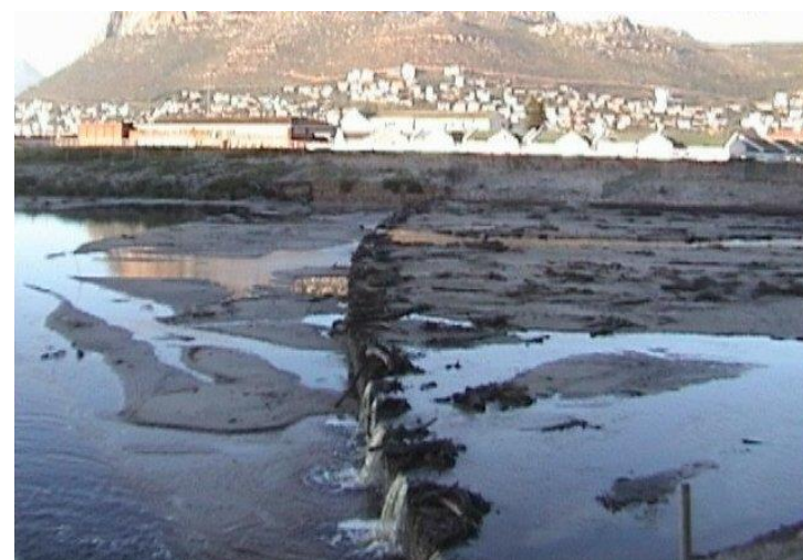
1 st Gabion Pond 2002