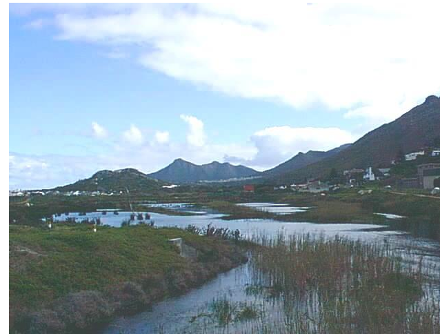
Silvermine River 2002