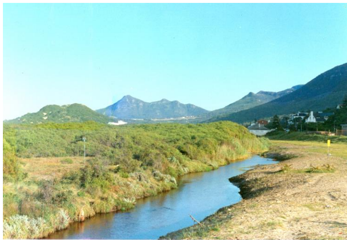
Silvermine River 1992

The Silvermine River has its source at several seeps above the dam in the Silvermine Nature Area and from seeps on the back of Kalk Bay Mountain – you can see the waterfall in winter from Ou Kaapse Weg. It is one of three pristine rivers in the Western Cape – the other 2 being the Lourens River and the Els River. You can get from source to sea on the Silvermine. It used to wander all over the lower Valley. When the railway bridge was built it became necessary to build dykes to stop the flooding in what is now the Silvermine Wetlands and to keep the river from wandering down as far as where the lighthouse is now. In 1969 there was a plan to build a Fish Hoek by-pass road, and the plan included canalising the river. Because of increasing development and the proposed canalisation of the river, The Silvermine River Society was formed in 1985. The group worked hard to remove and control alien vegetation along the banks of the river. In 1987 they produced a document showing how the river, rather than being canalised, could be preserved by formatting a flood control measure and maintaining a wetland aspect to the area. Preliminary work commenced in 1998 and major construction in 2000. Here are some before and after photos. Routine maintenance is now carried out by the Riverine Rovers (see below).